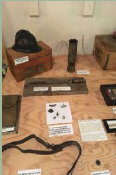
World War I Items

Display 6: Post WWII. Includes artifacts from USA.