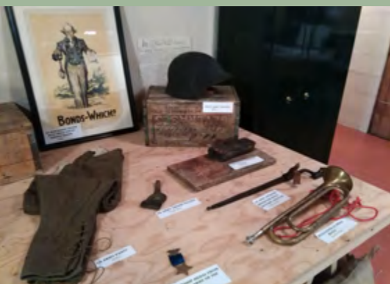
Items from the Civil War & 19th century

about a year to collect the other military artifacts in his museum, from tag sales, online stores and items that were given to the museum. The website for the museum can be found by clicking on the link on the next page. There you can see photos of the museum, including a gallery showing