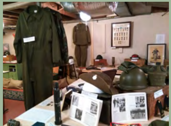
Korean War & Vietnam war items