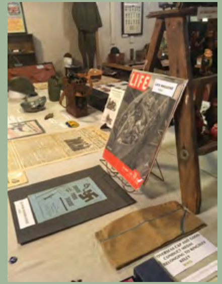
World War II Items