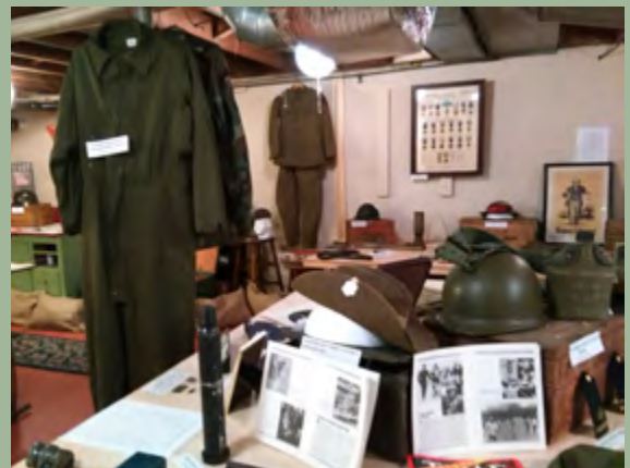
Korean War & Vietnam war items