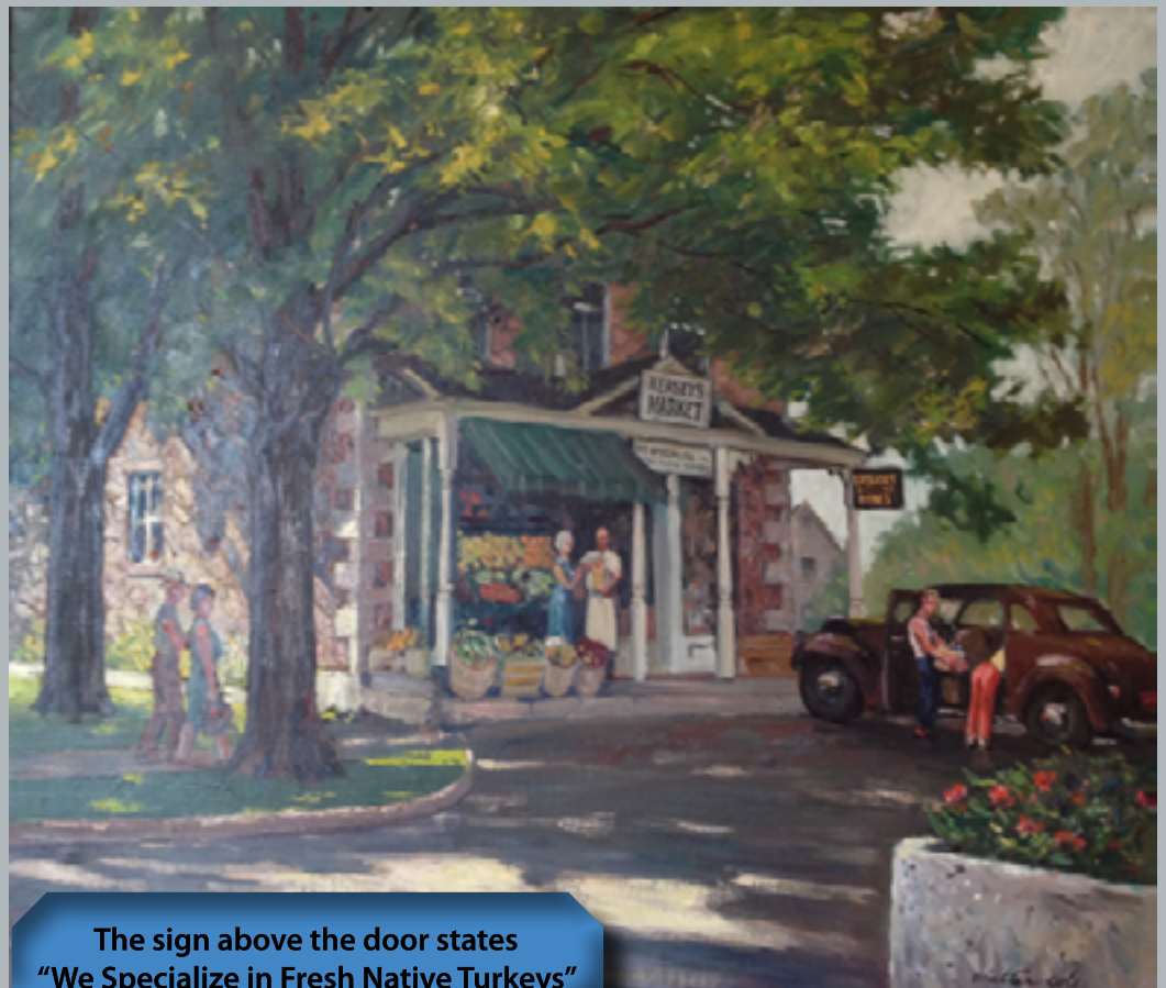
The sign above the door states "We Specialize in Fresh Native Turkeys"