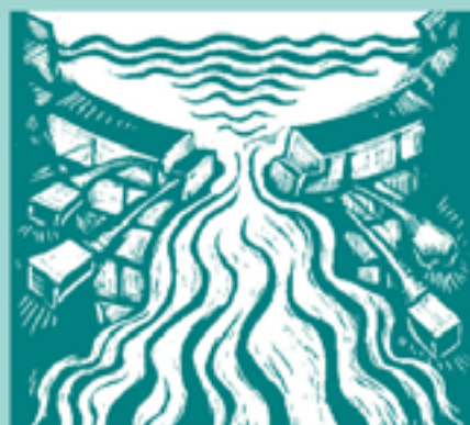
Exhibit on the proposed hydroelectric project that nearly flooded half of Sheffield