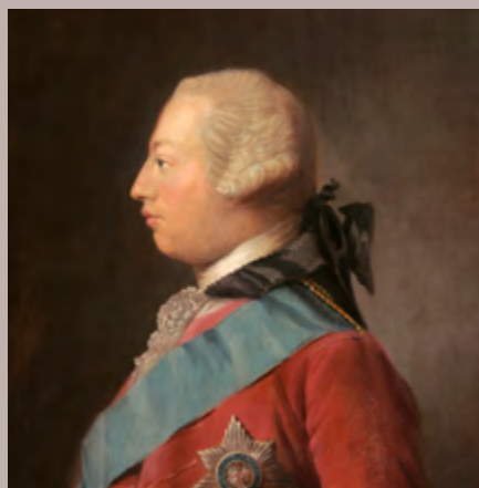
King George III in 1762